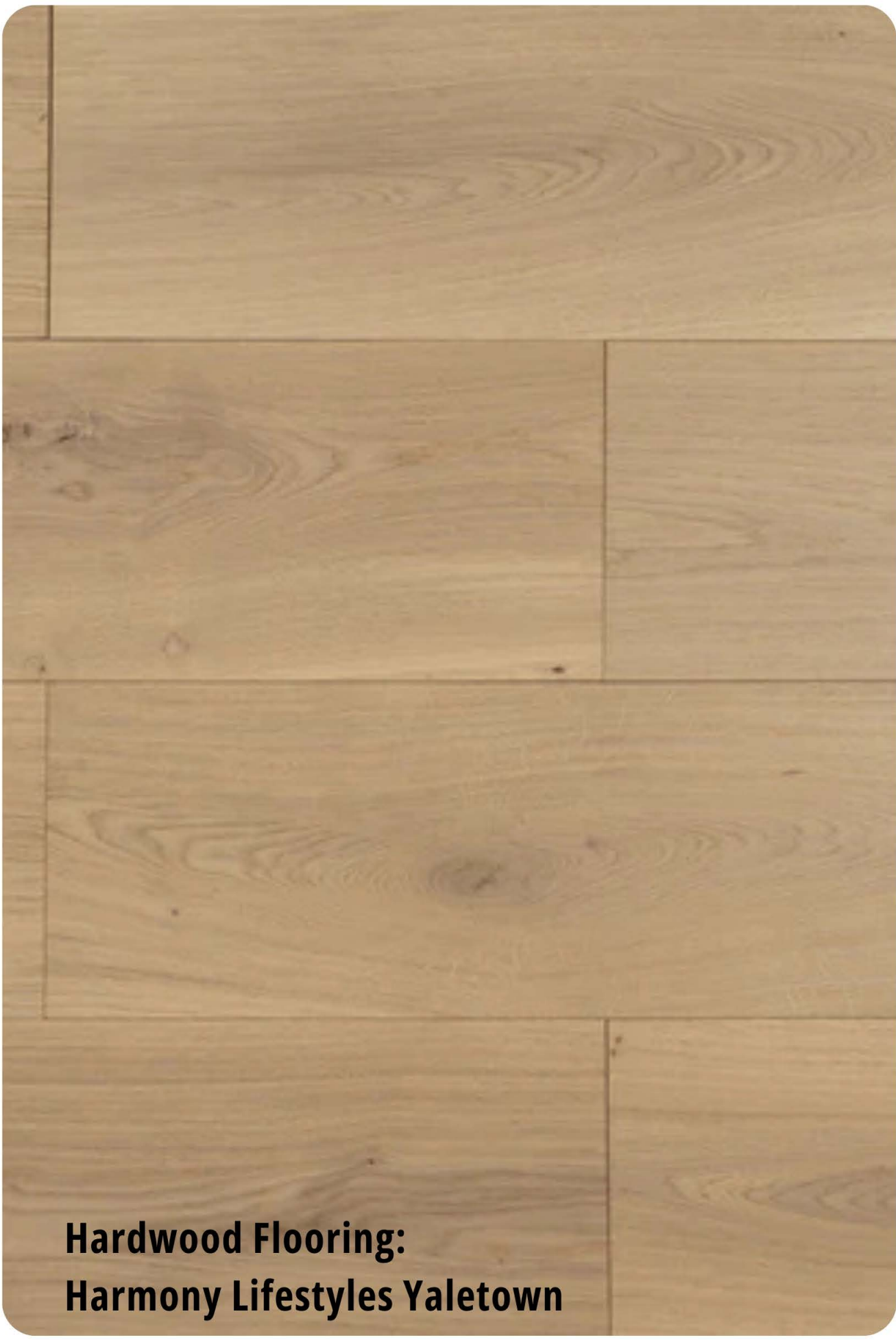
Hardwood Flooring: Harmony Lifestyles Yaletown