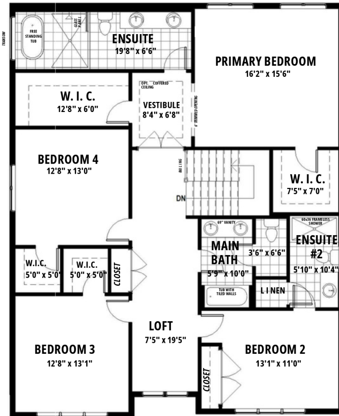
2ND FLOOR | 8' CEILINGS