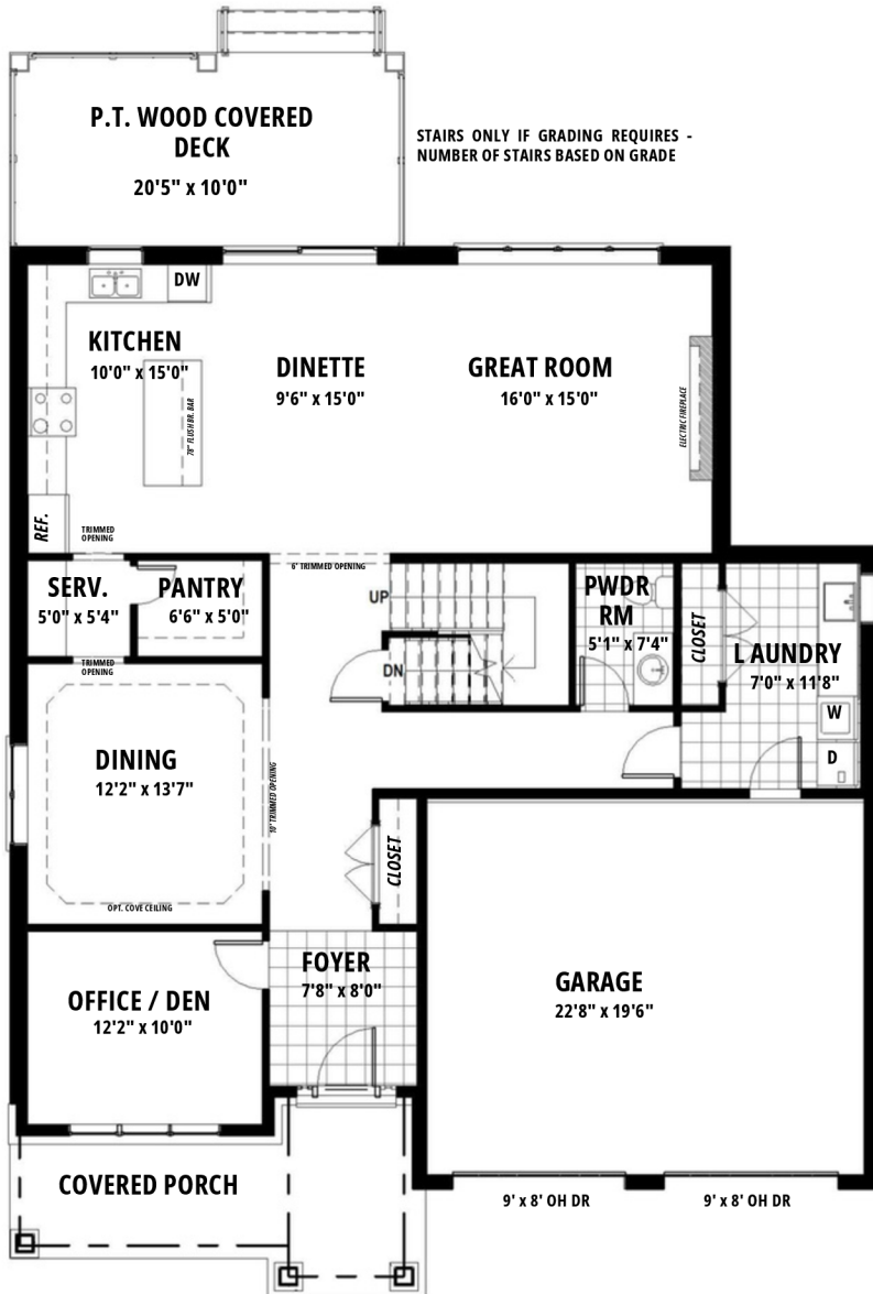
MAIN FLOOR | 9' CEILINGS