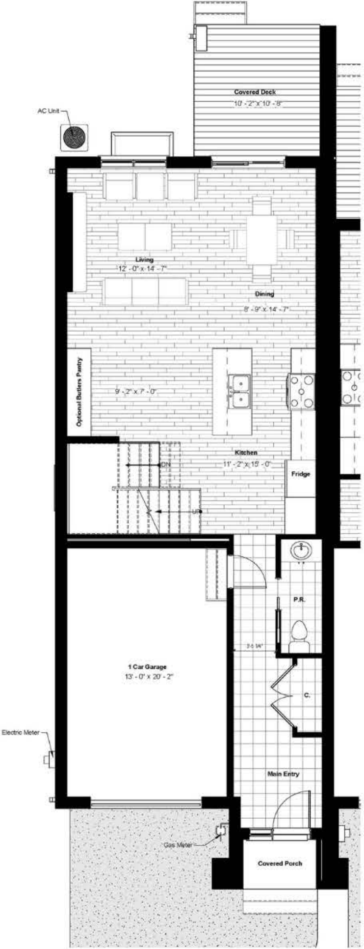
Main Floor 875 sq ft