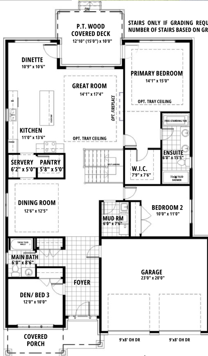
MAIN FLOOR | 9' CEILINGS