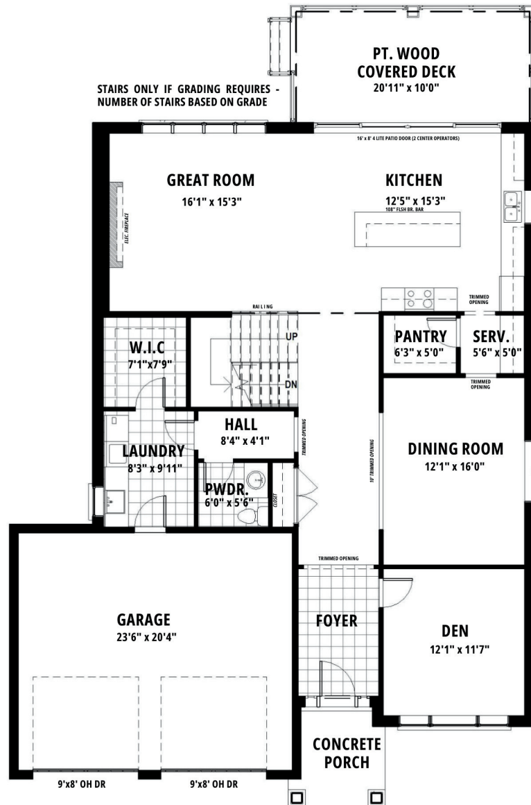
MAIN FLOOR | 9' CEILINGS