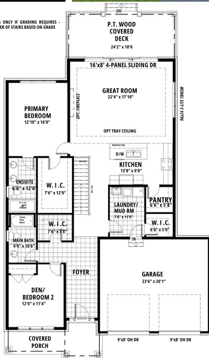
MAIN FLOOR | 9' CEILINGS

STAIRS ONLY IF GRADING REQUIRES - NUMBER OF STAIRS BASED ON GRADE