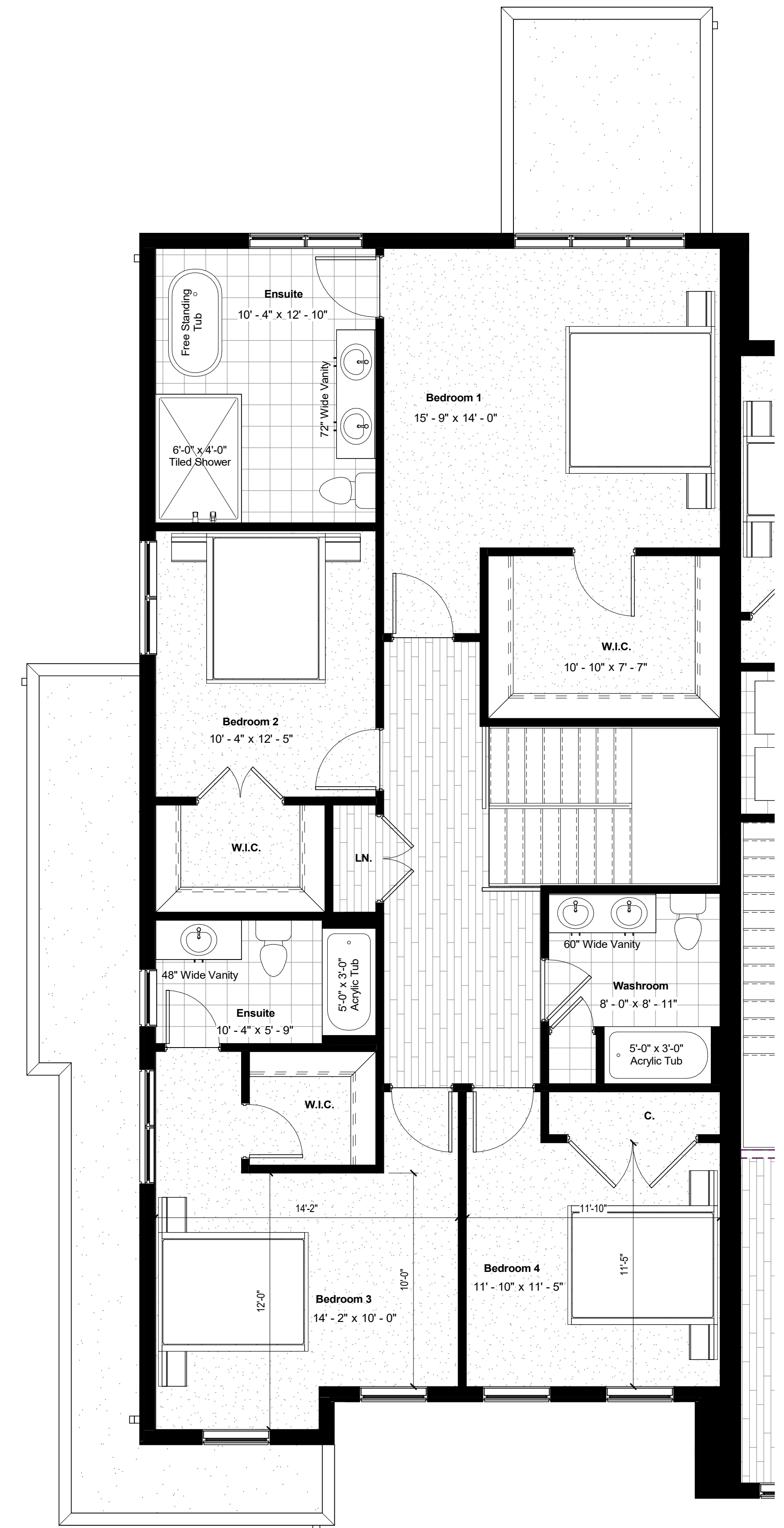
3 Enlarged Plan - Unit Type D - Second Floor Level scale: 1/4" = 1'-0"