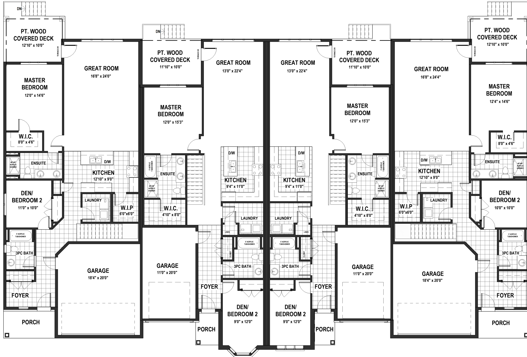
UNIT 24 TYPE - C 1462 SQ.FT.

BLOCK 54 MITCHELL CRESCENT FORT ERIE, ONTARIO