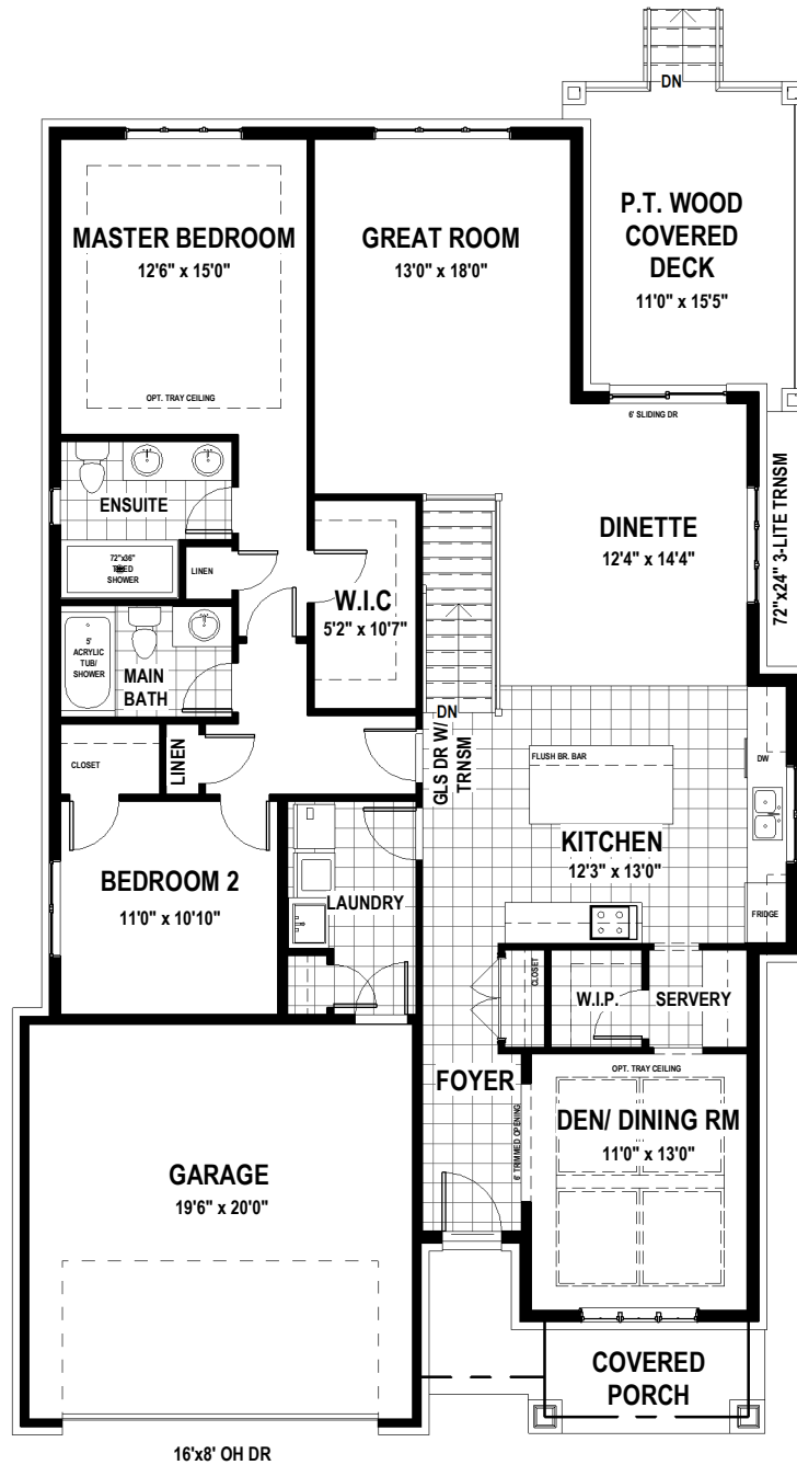
MAIN FLOOR - 1845 SQ.FT. - 9' CEILINGS